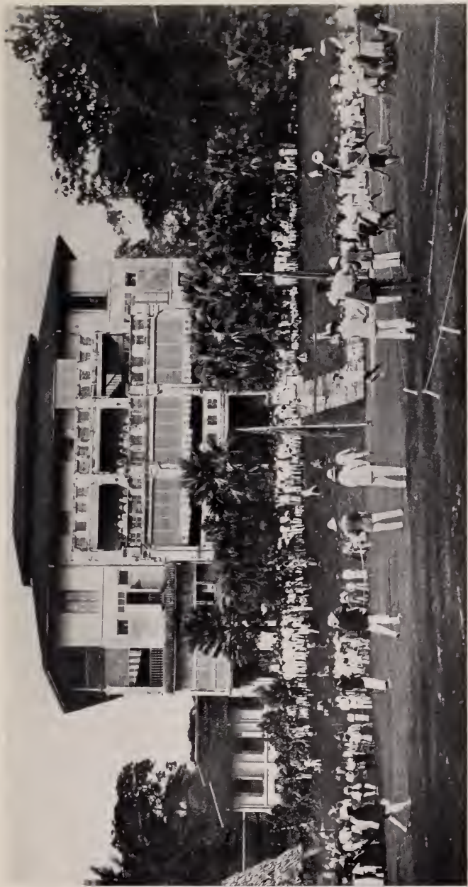
Field day at a Christian college in Singapore